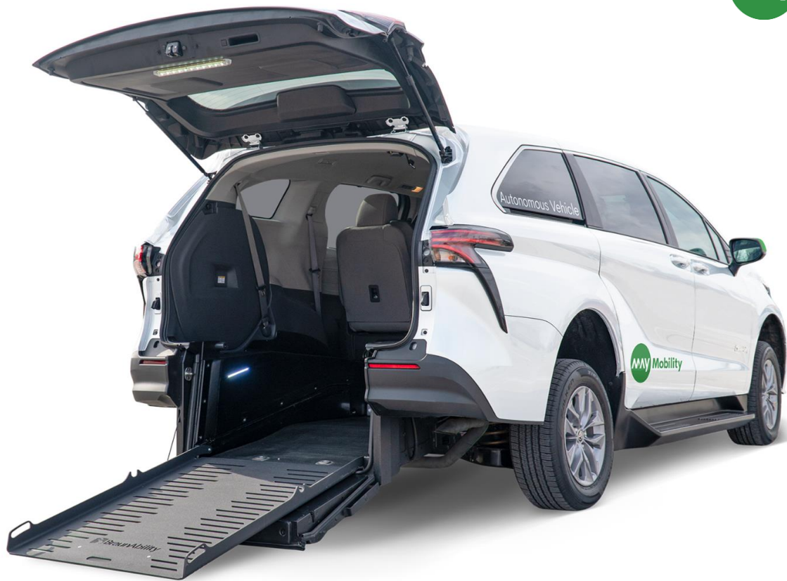
The Toyota Sienna Autono-MaaS