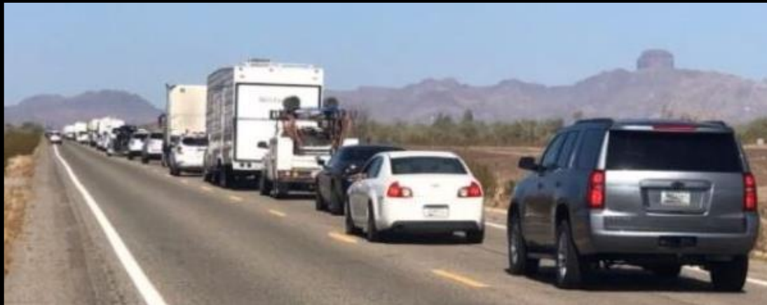
Congestion - U.S. 95