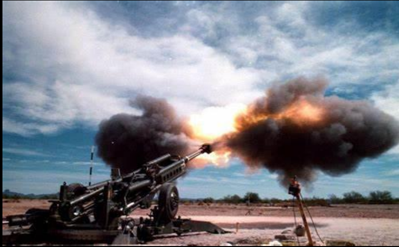
YPG - LIVE FIRE