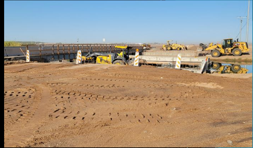
U.S. 95 Bridge Construction