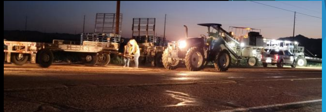
Agriculture - U.S. 95