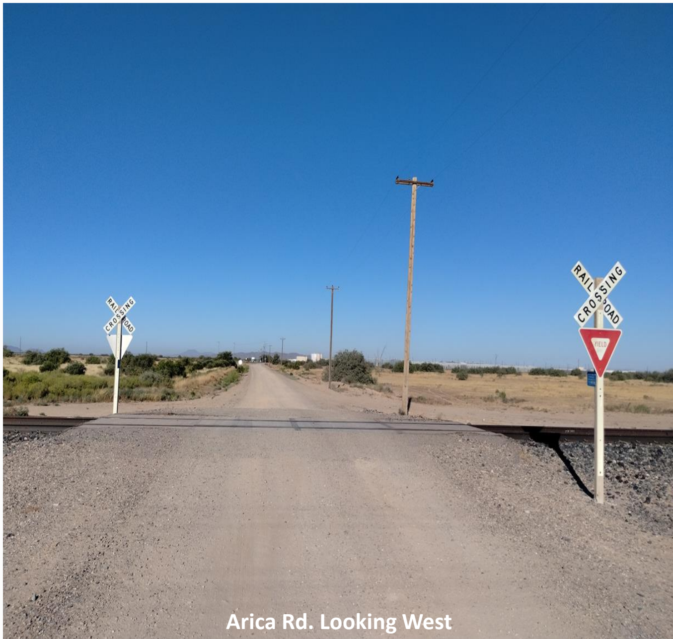
Arica Rd. Looking West