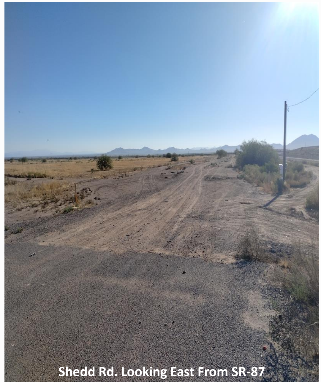
Shedd Rd. Looking East From SR-87