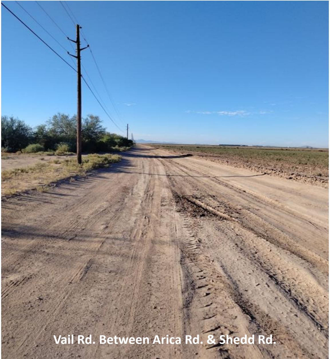
Vail Rd. Between Arica Rd. & Shedd Rd.