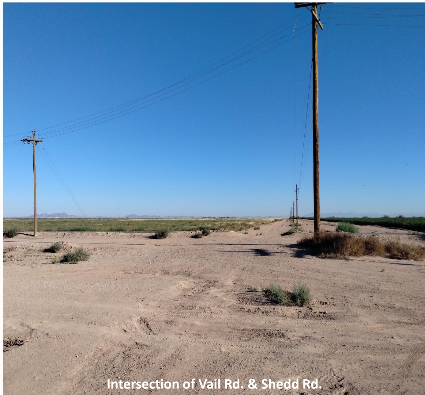
Intersection of Vail Rd. & Shedd Rd.