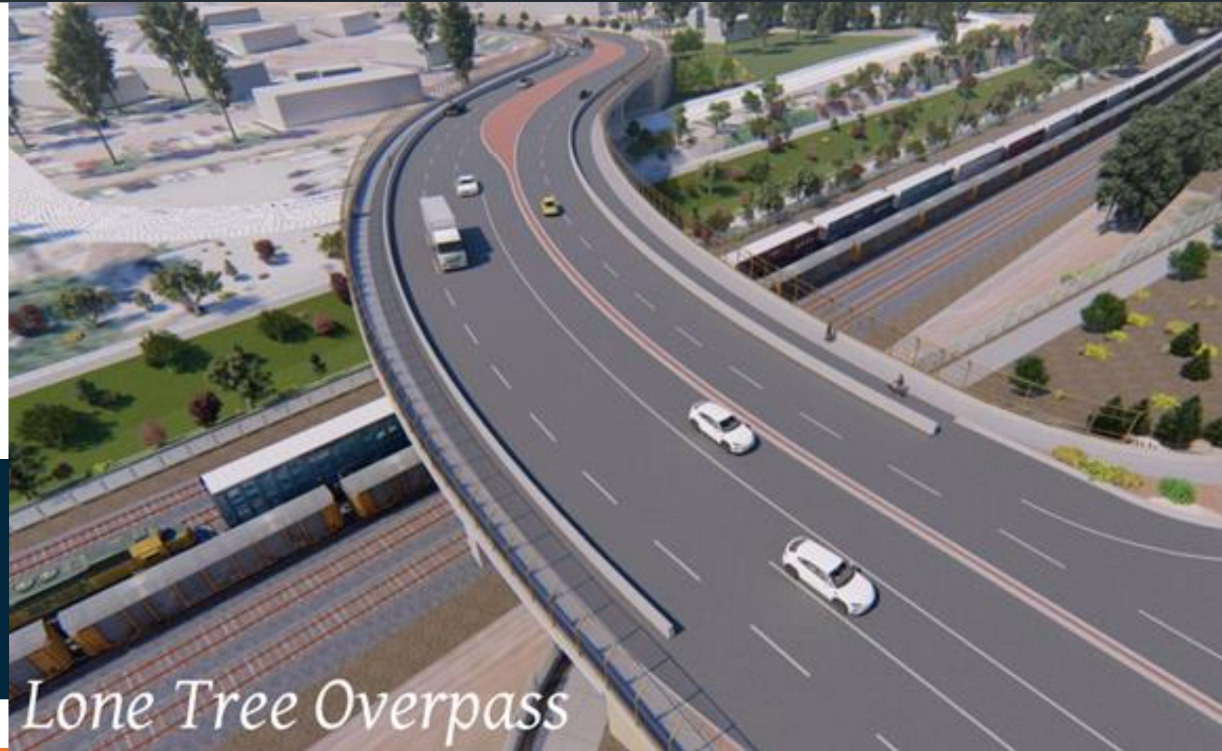
Lone Tree Overpass

Proposition 420 will cost 23 cents on a $100 purchase. Proposition 420 would be in effect for the next 20 years.